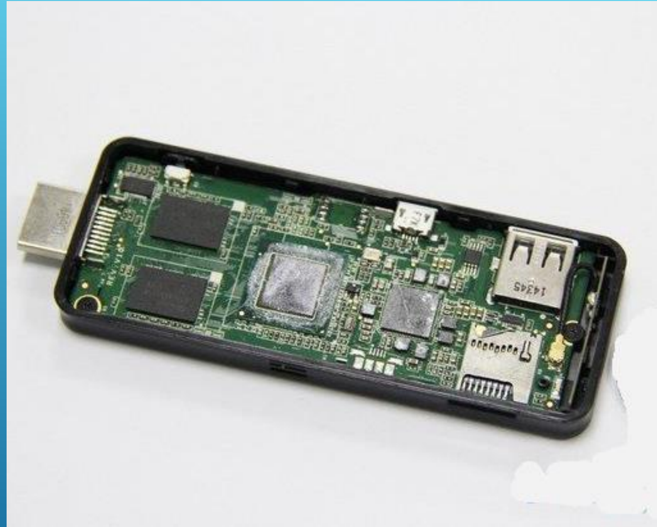
PC on a Stick