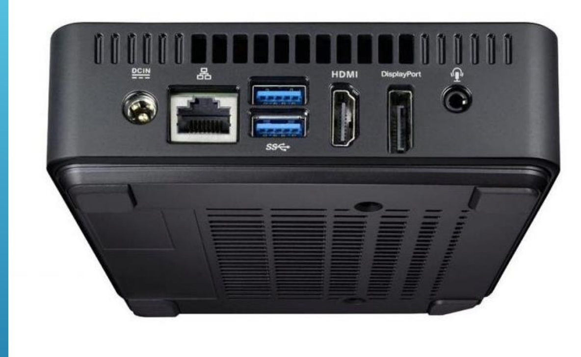
ASUS Chromebox (Chrome OS)